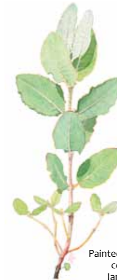
Painted seedling courtesy of Ian Roberts.