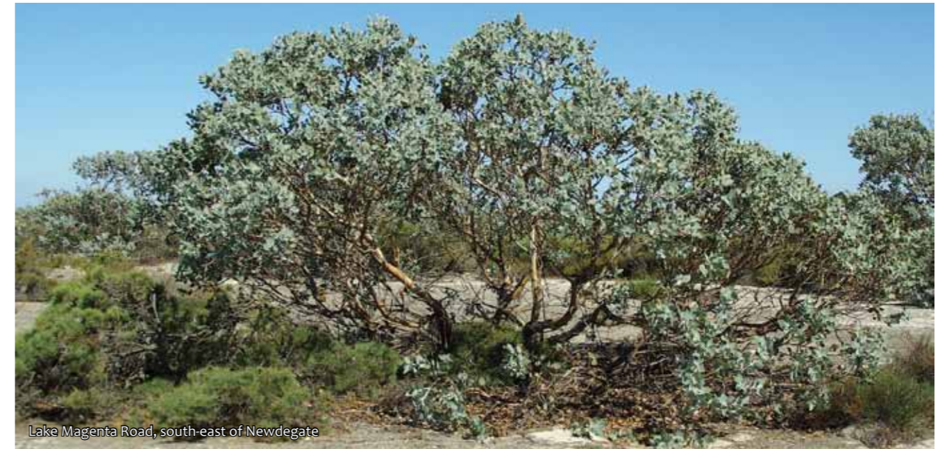
Lake Magenta Road, south-east of Newdegate

Eucalyptus gittinsii subsp. illucida (northern sandplain mallee) is distinguished from E. pleurocarpa by its lanceolate, blue-green non-glaucous leaves and non-glaucous adult parts (elliptical, blue-grey, glaucous leaves and glaucous adult parts in E. pleurocarpa ).