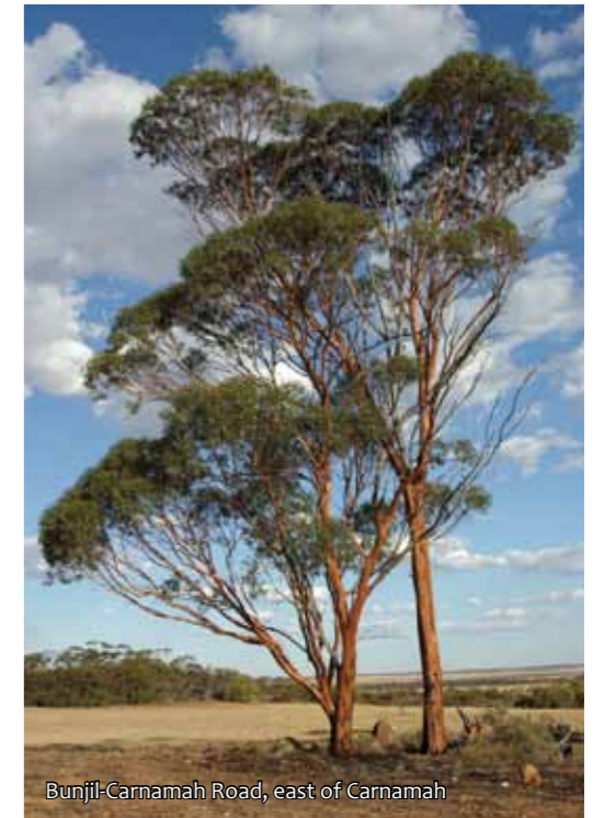
Bunjil-Carnamah Road, east of Carnamah