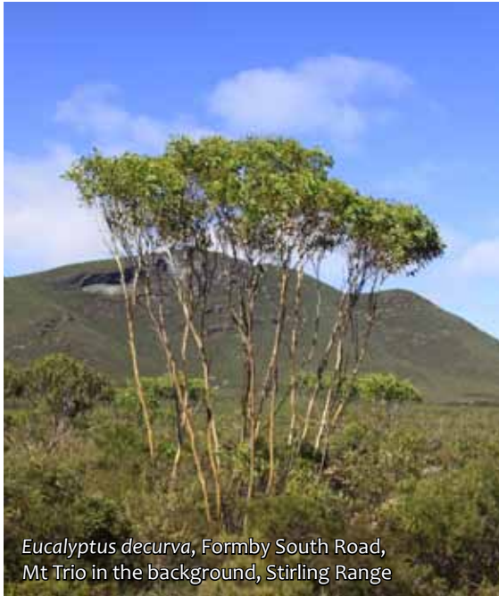
Eucalyptus decurva , Formby South Road, Mt Trio in the background, Stirling Range