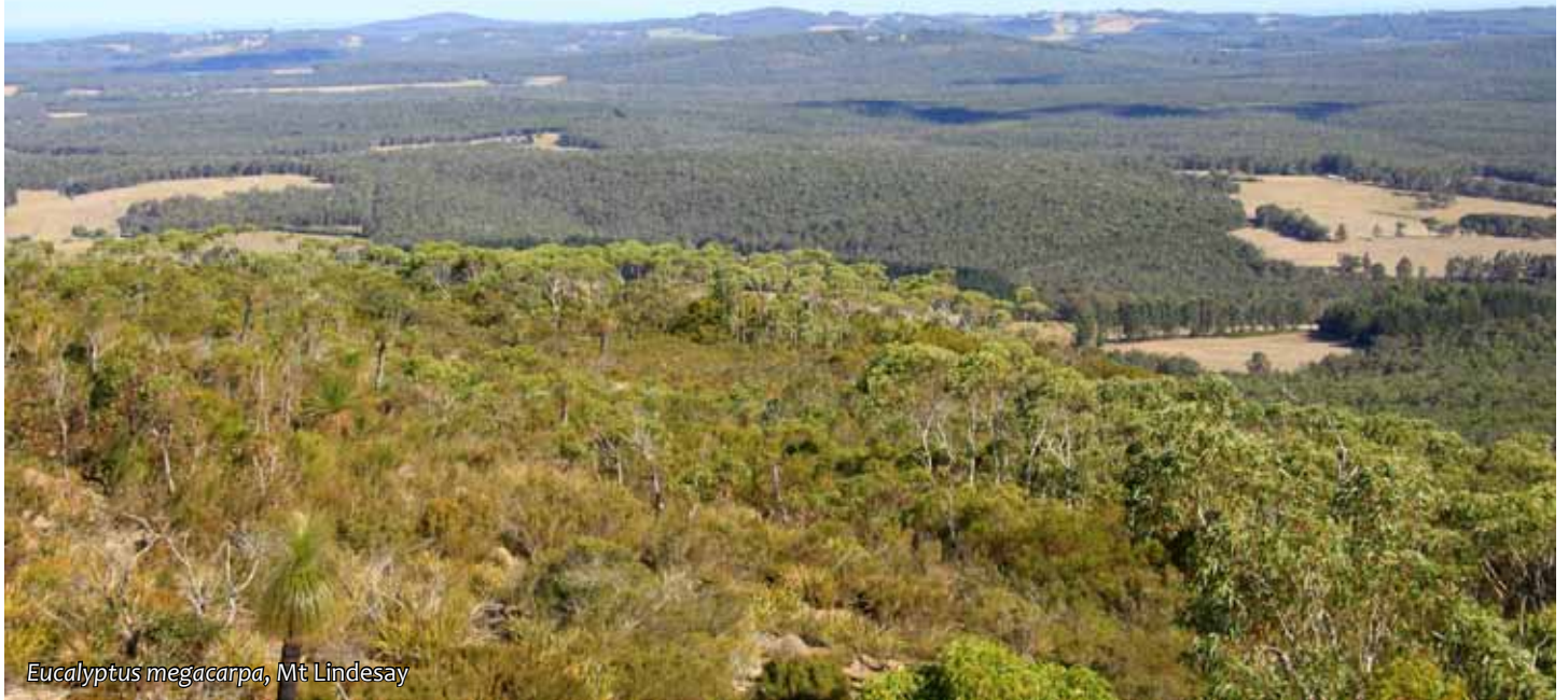
Eucalyptus megacarpa , Mt Lindesay

Early April one very smoky day, on a great walk to the summit of Mt Lindesay, north of Denmark, encountered E. megacarpa populations below the summit and at the summit, E. marginata subsp. marginata (recovering from fires of several years ago).