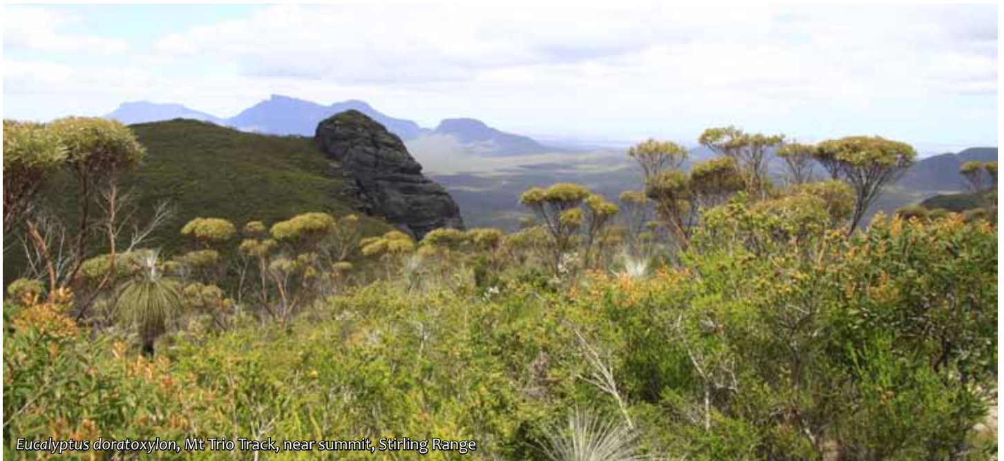
Eucalyptus doratoxylon , Mt Trio Track, near summit, Stirling Range