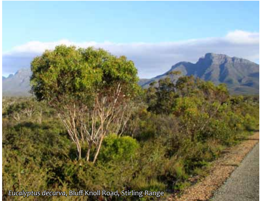
Eucalyptus decurva , Bluff Knoll Road, Stirling Range