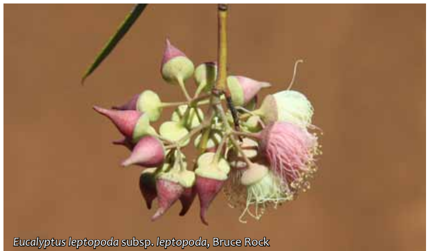
Eucalyptus leptopoda subsp. leptopoda , Bruce Rock