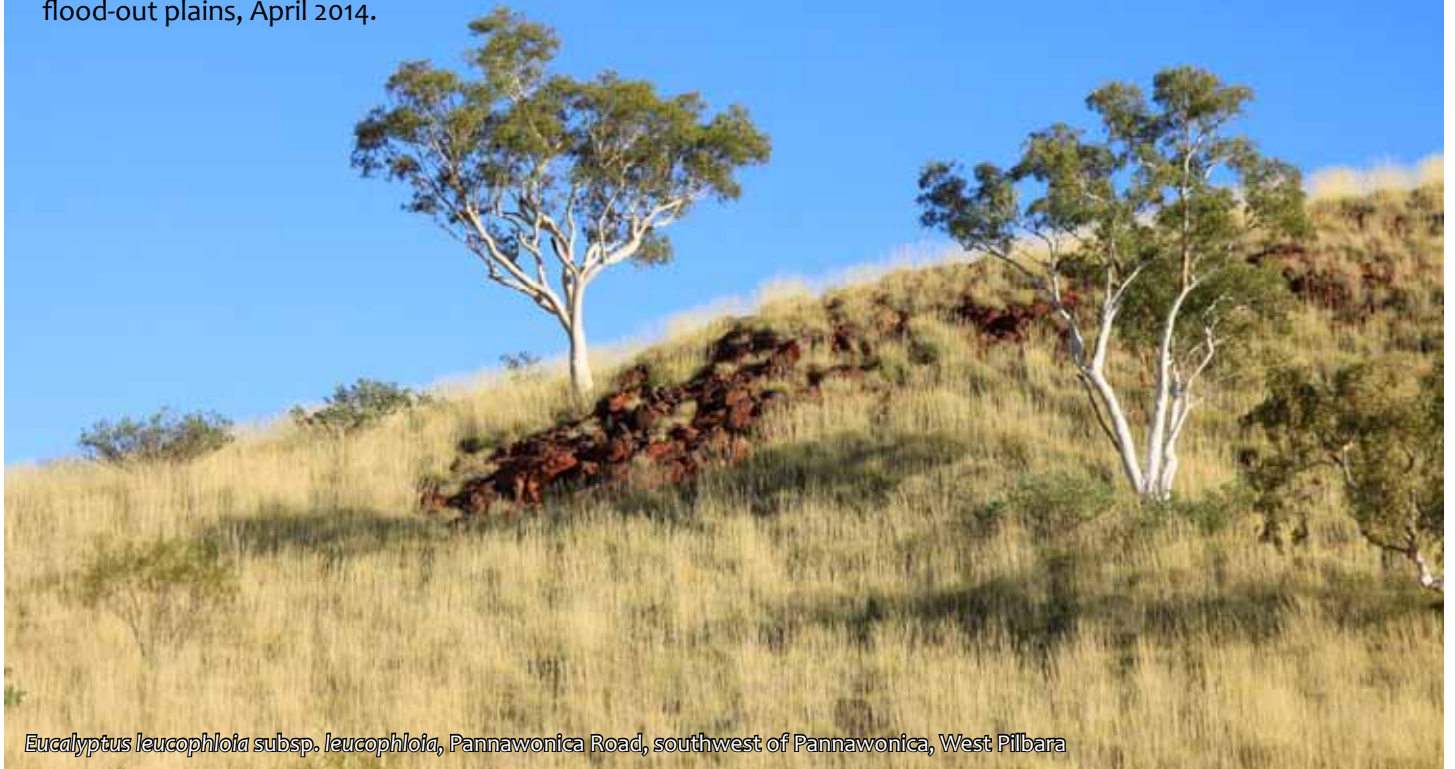
Eucalyptus leucophloia subsp. leucophloia , Pannawonica Road, southwest of Pannawonica, West Pilbara

Snappy gum, Eucalyptus leucophloia , is always special on the ranges in the Pilbara, similarly, Corymbia candida on the Pilbara flood-out plains, April 2014.