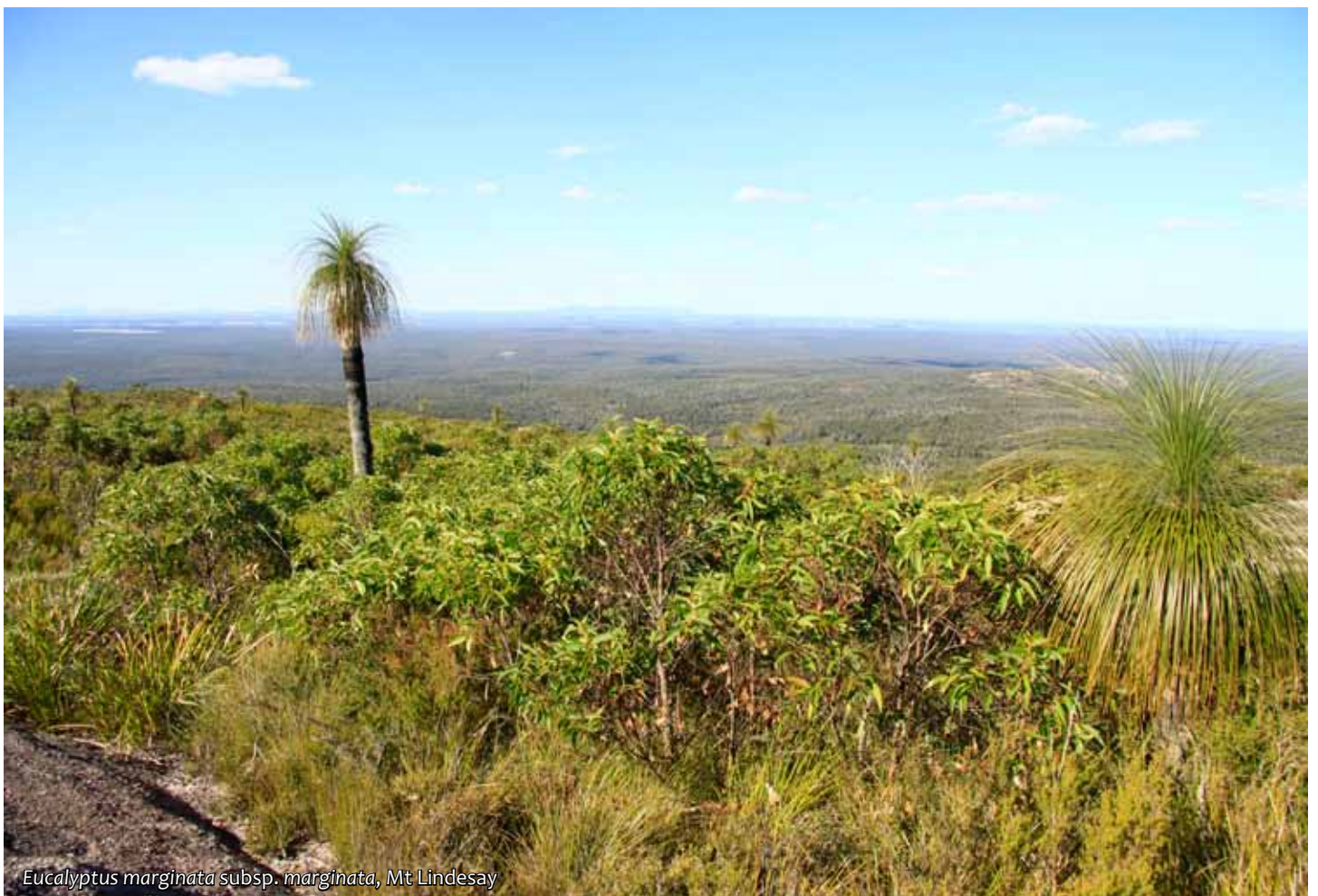
Eucalyptus marginata subsp. marginata , Mt Lindesay