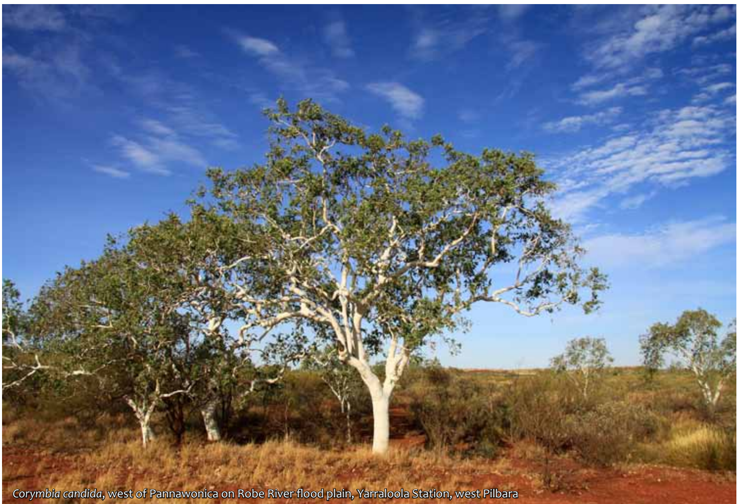
Corymbia candida , west of Pannawonica on Robe River flood plain, Yarraloola Station, west Pilbara